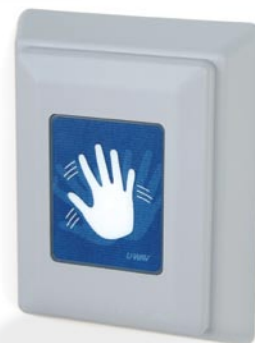
Available in Flush Mount and Surface Mount options